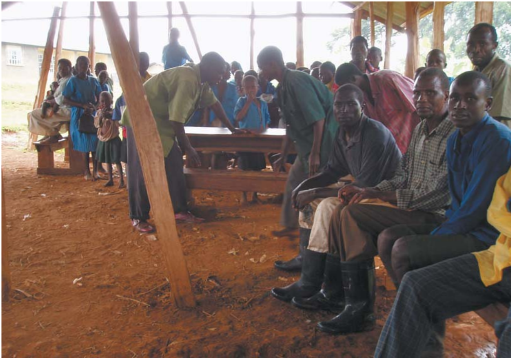
Meeting in a village near the boundary of the national park, July 2006. “We don’t want the whole national park, we just want our land back.”