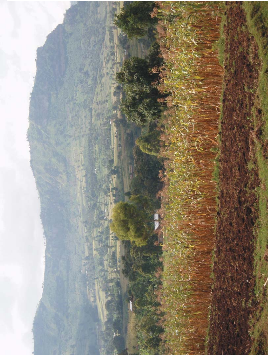
Maize is one of villagers' main crops around Mount Elgon. In the background is part of the national park.