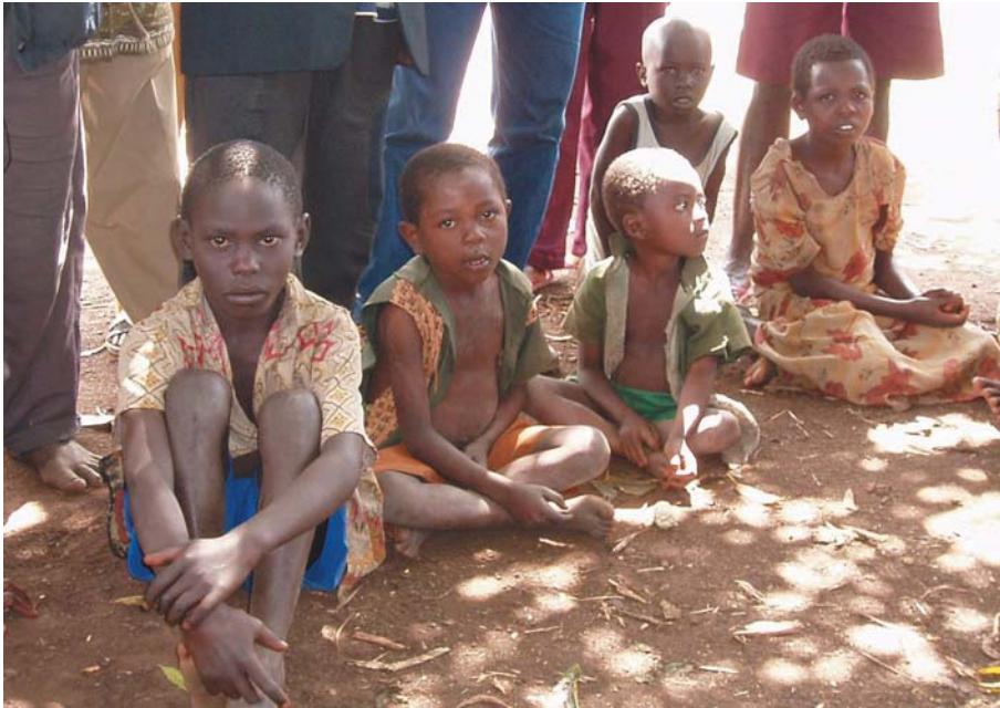
Most of the children in this village do not go to school because villagers have no money to send them.