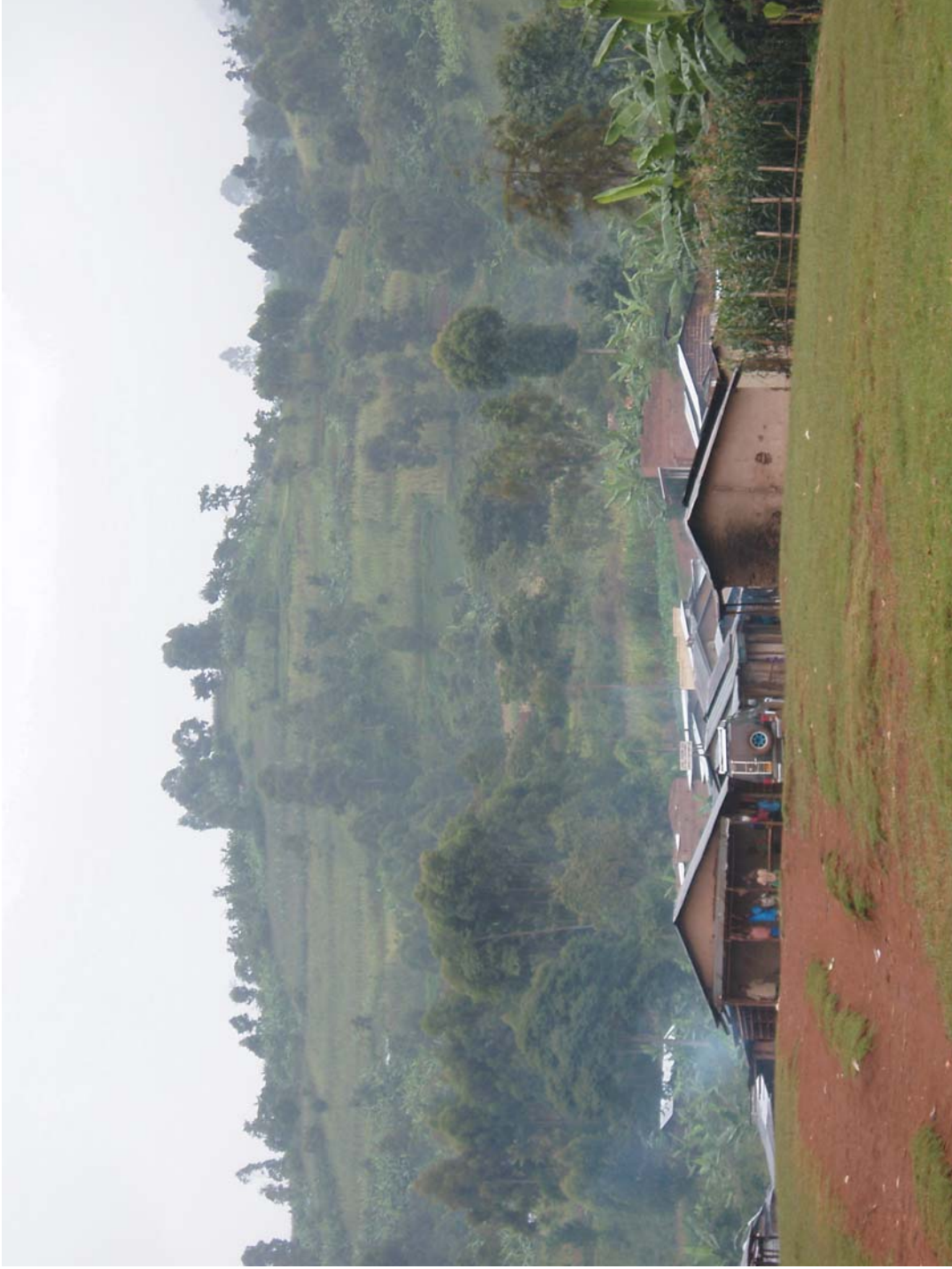
The fields in the background are inside the national park. Villagers have been prevented from harvesting these crops. “We have planted the land, but we are threatened day and night. UWA sometimes destroys our crops,” one villager told us.