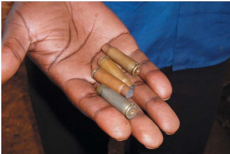
Bullet shells. “The bullets were shot by people trying to kill us,” a villager told us. “Some people have died. Others have been injured.”